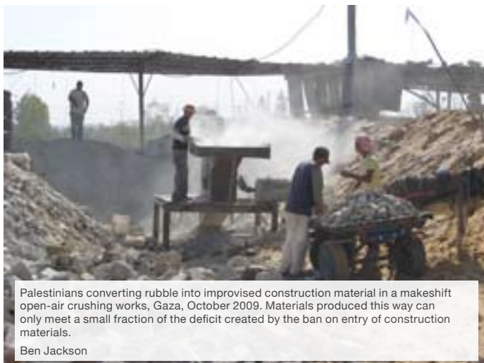
Palestinians converting rubble into improvised construction material in a makeshift open-air crushing works, Gaza, October 2009. Materials produced this way can only meet a small fraction of the deficit created by the ban on entry of construction materials.