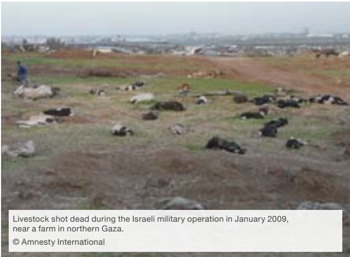
Livestock shot dead during the Israeli military operation in January 2009, near a farm in northern Gaza.